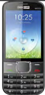
MaxCom 320 0 EUR