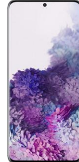
Samsung S20 23.49EUR