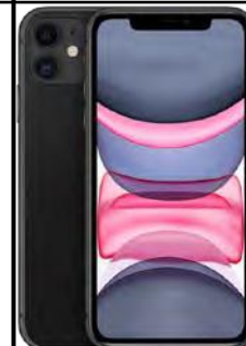
Iphone 11 12864GB 0 EUR