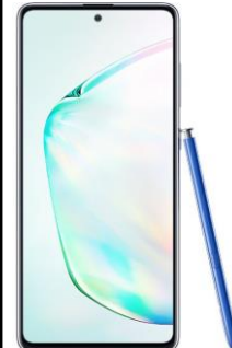
Samsung Note 10 light 5 EUR