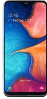
Samsung A40 0 EUR