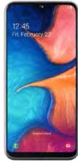
Samsung A10 17.1 EUR