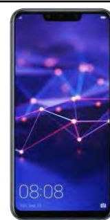
Huawei P 30LITE 0 EUR