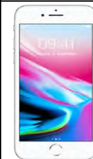
Apple iPhone 8 64GB 0 EUR