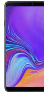
Samsung A51 0 EUR