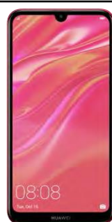
Huawei P SMARTZ 0 EUR