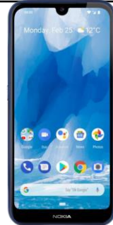
Nokia 4.2 32 GB 19.62 EUR