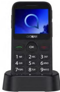
Alcatel 2019 Senior 0 EUR

Telefoane in limita stocului. Traficul internet ce poate fi consumat in roaming SEE se calculeaza dupa formula reglementataUE.