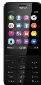
0 EUR Nokia 230 16MB Dual SIM