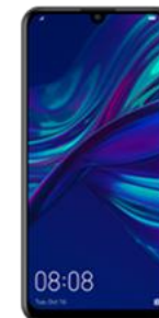
0 EUR Huawei P Smart 2019 64GB Dual Sim