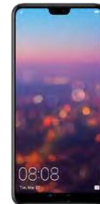
11 EUR Huawei P20 PRO