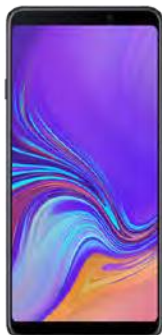
SamsungA9 0 EUR