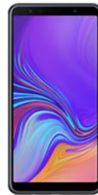
55 EUR Samsung Galaxy A7 64GB Dual SIM