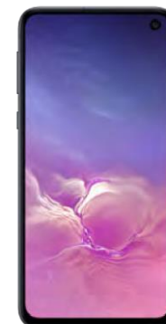
SamsungS10 E 128GB 234.87EUR

Ab. 10.1EUR + Ab. 10.1EUR + Ab. 10.1 EUR + Ab. 10.1 EUR =