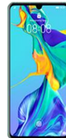
0 EUR Huawei P30 128GB Dual SIM