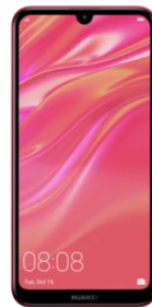
66 EUR Huawei Y7 Dual SIM 2019