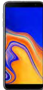
0 EUR Samsung J4+ Dual Sim