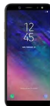
SamsungA6 DUALSIM2018 0EUR

Ab. 10.1EUR + Ab. 10.1EUR + Ab. 10.1 EUR + Ab. 10.1 EUR =