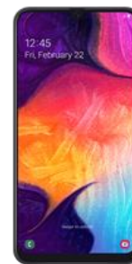
33 EUR Samsung A50 Dual Sim