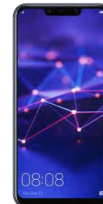
0 EUR Huawei P20 Lite 64GB Dual Sim