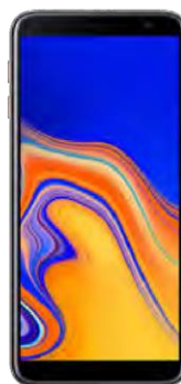
SamsungJ4 Plus DUAL SIM 4 EUR