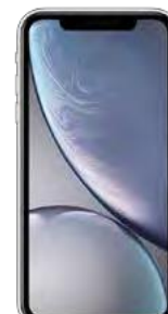
167 EUR Iphone XR 64GB